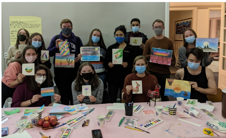
The first in-person "fellowship" night since February 2020!