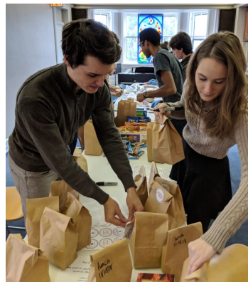
Preparing lunches for local shelter