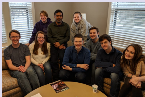
Newly Elected 2019-2020 Student Leadership Board