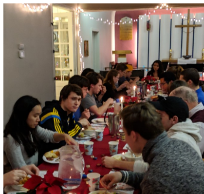
LCMNU Christmas Celebration