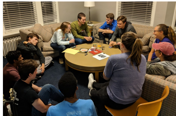
Game Night at LCMNU